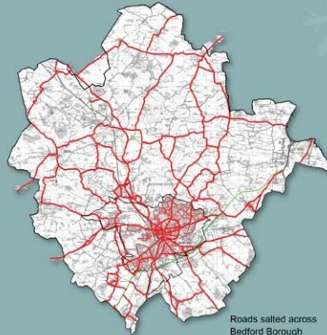
Roads salted across Bedford Borough

If you have any questions, please telephone our Highways Helpdesk on 01234 228661. The Council does not look after the A421 and A1 trunk roads. CarillionWSP look after these roads and they can be contacted on 01536 413700.