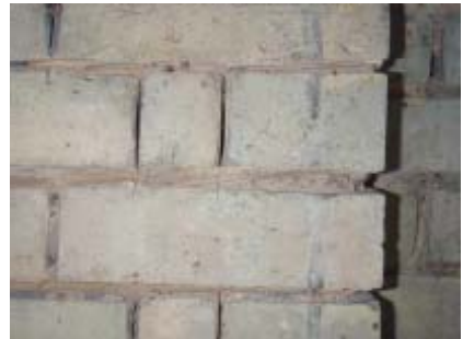
Brickwork damaged by angle grinding

of finish, if done properly new pointing will quickly blend with the existing. In preparing for re-pointing, mortar should not be forcibly removed using angle grinders or any other method which is likely to damage the arisses of the bricks or stones or increase the joint widths. Such damage is irreversible and can severely harm the appearance of a wall. Loose pointing should be removed manually using a knife or