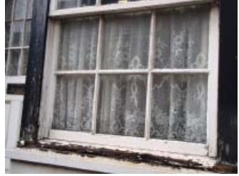
The consequences of poor maintenance

Repair of windows and doors should be undertaken using timber spliced on to the existing frames, though for smaller repairs, resin may be acceptable. A traditional joiner should be able to undertake such repairs. Where repainting is required, it is advisable to use breathable microporous paints as they allow passage of water vapour, ensuring that moisture does not build up in the timber. Where glazing requires replacement, modern cylinder or imperfect glass types is preferable to dead flat modern float glass.