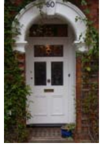
Beautiful Victorian doors

The majority of the historic windows in Bedford Conservation Area are timber sliding sash windows though side-hung casement types are not uncommon on less prominent elevations. Most nineteenth century windows are of softwood imported from Scandinavia and the Baltic States. This slow-grown, high quality durable timber is far superior to the inferior species used today, which require chemical preservatives to ensure some degree of longevity. Many windows retain their historic cylinder glass, the irregular character being formed by the ripples and air bubbles, causing distorted reflections, making a subtle, but significant, contribution to the character of buildings in the Conservation Area. Doors may contain etched or stained glass which can add greatly to the appeal and exuberance of historic entrances.