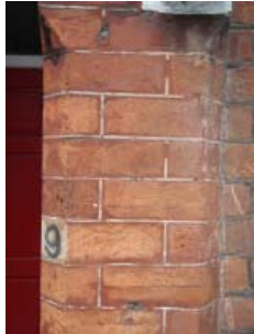
Late 19th century tuck pointing

spike, or where there are harder sections, using a sharp chisel and hammer. However, care must be taken to ensure bricks and stones are not damaged. Where a wall has previously been repointed in a very hard cement mix it is often best left to loosen naturally over time, as removal may create more damage.