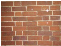
A good mix of colours and tones

It is advised that bricks and stones should only be replaced where they have lost their structural integrity because of deep erosion or where weatherings are no longer performing the function of throwing water clear of surfaces below.