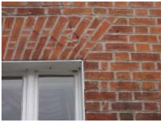
Examples of poor brick and stone pointing

The sand should have a range of aggregate sizes to prevent rapid shrinkage and to provide a satisfactory match to the original mortar. Modern soft building sands are rarely suitable as they have a relatively uniform aggregate size and high proportion of 'fines', often producing dark ochre colours rather than the lighter cream shades of traditional mortars. A better match will usually be produced by using sharp or plastering sands which tend to have a more suitable range of aggregate sizes and will result in a 'gritty' finish.