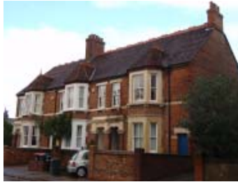
Original clay tile roofs and concrete tile replacement