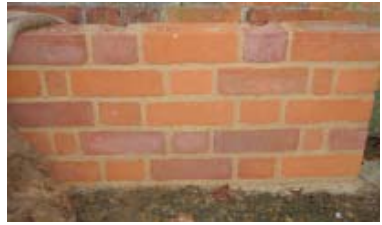
Examples of good brick and stone pointing

As discussed above, it is always advisable to use pure lime mortars for repointing and rebuilding areas of traditional brick and stonework rather than ones containing cement. These may be pure lime putty mortars though hydraulic lime mortars (please note that this is a different material to hydrated lime) of strength NHL2 to NHL3.5 may be suitable as these will also provide a permeable mortar. In addition to allowing the building to breathe, lime mortars will also usually provide a better colour match to the existing traditional mortar than cement based mortars. Mixes will vary according to stone or brick type along with location on the building and therefore relative strength required (eg. chimneys will usually require a relatively stronger mix). A general guide to an appropriate mix will be a proportion of 1:3 of lime to sand by volume.