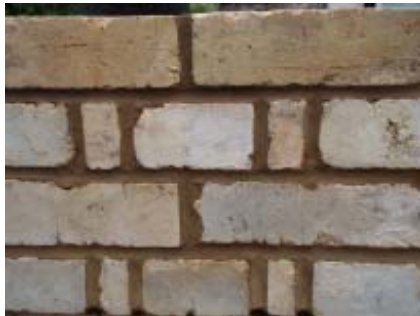
Inappropriate bucket handle joints and ribbon pointing

The joint should be finished in accordance with the original form where there is evidence of it. This is particularly applicable where joints are finished with a special treatment (providing this is original and not recent) eg. an incised line in the centre of each joint or 'tuck' pointing. Where this is not the case, a fractionally recessed brushed finish is usually appropriate. Mortar should not spread beyond the joint onto the face of the stone or brick as this can severely disfigure the overall appearance of the wall. Relatively recent forms of joint finish such as 'strap' or 'ribbon' pointing, bucket handle and weather-struck are unsuitable for historic buildings work and can lead to damage of the brick or stone.