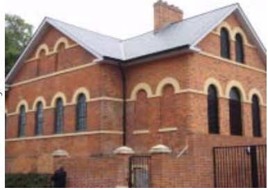
Bedford Gallery - re-roofed in slate

Prior to the mid 20th century the roofing materials used in the Conservation Area were plain clay tile, natural slate and lead. While there has been more recent replacement of roof coverings with materials such as concrete tile and artificial slate, a significant proportion of the buildings retain these original roof coverings and they provide a characteristic feature of the town's architecture. Where planning permission is required for changing a roof covering, the Council will seek to ensure that original roof coverings are preserved. Total re-roofing of a listed building will usually require listed building consent and early or original roof coverings must be preserved.