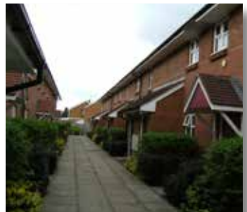
Raglan flats within the project