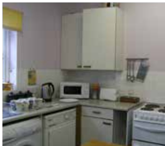
Our fully fitted Training Kitchen

We aim to link closely with Supported Employment Services to support you to look for opportunities, at the right time to help you to become work ready, explore work placements, volunteering and paid employment where possible.