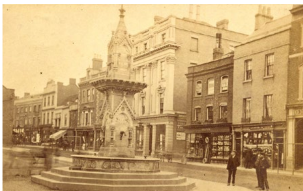
The Turnley Fountain (c1870, © Bedford Museum Collection)

The programme is designed to encourage partnerships with local organisations, building owners and occupiers to secure lasting improvements to buildings and the public realm. Combined with traffic calming measures the appearance and air quality of the High Street will improve, making the Town a more desirable place to live and work, whilst increasing the awareness of Bedford's heritage, for the benefit of local people, businesses and visitors.